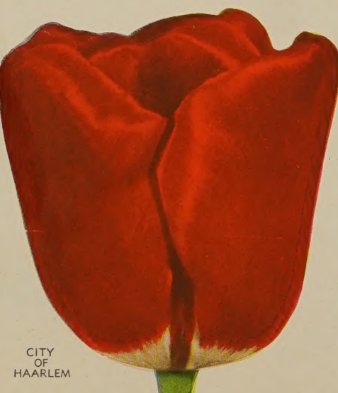
CITY OF HAARLEM